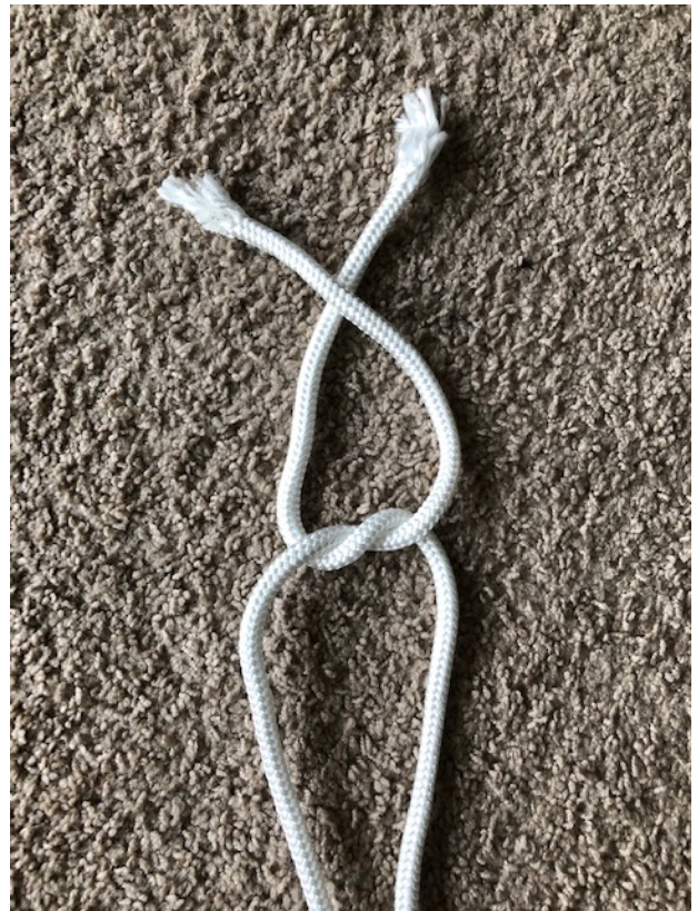
Step 4: Take the top bits of rope and place the top that is on the right, over the top that is on the left.