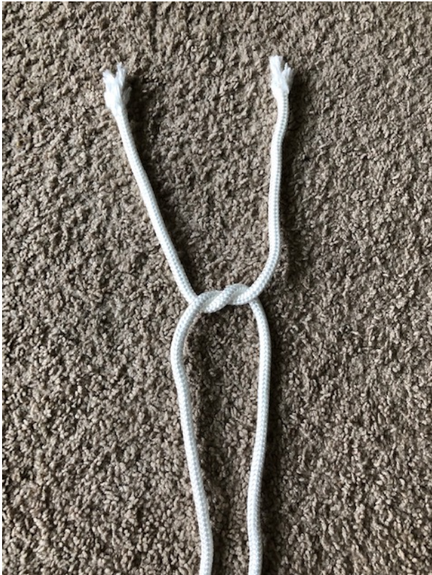
Step 3: Tuck the rope from the left underneath the rope on the right.