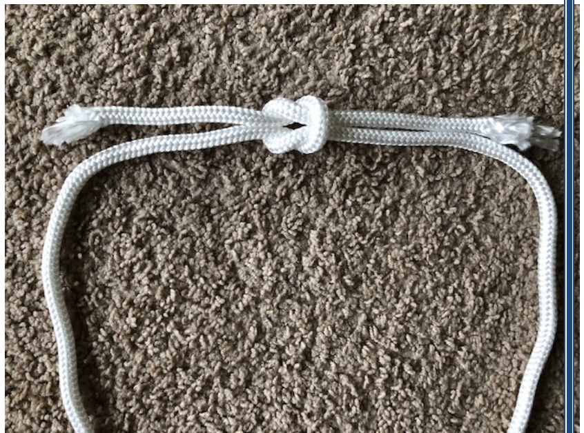
Step 6: Pull it tight! If the ropes move freely and looks like a figure eight (8) then you know you've done it right!